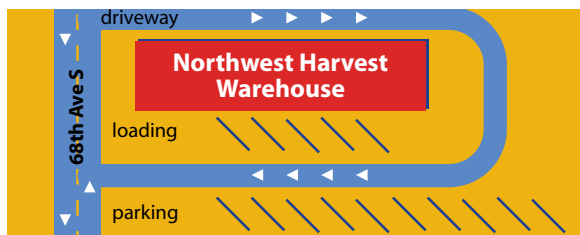
Northwest Harvest Warehouse

From Seattle: Take I-5 south to left exit 154 A. Merge onto I-405 north towards Renton. Take WA-181 S./West Valley Hwy. (exit 1) towards Tukwila. Make a right at fork onto West Valley Hwy. West Valley Hwy. becomes 68th Ave. S. Cross S. 212 St.; turn left into Northwest Harvest Warehouse.